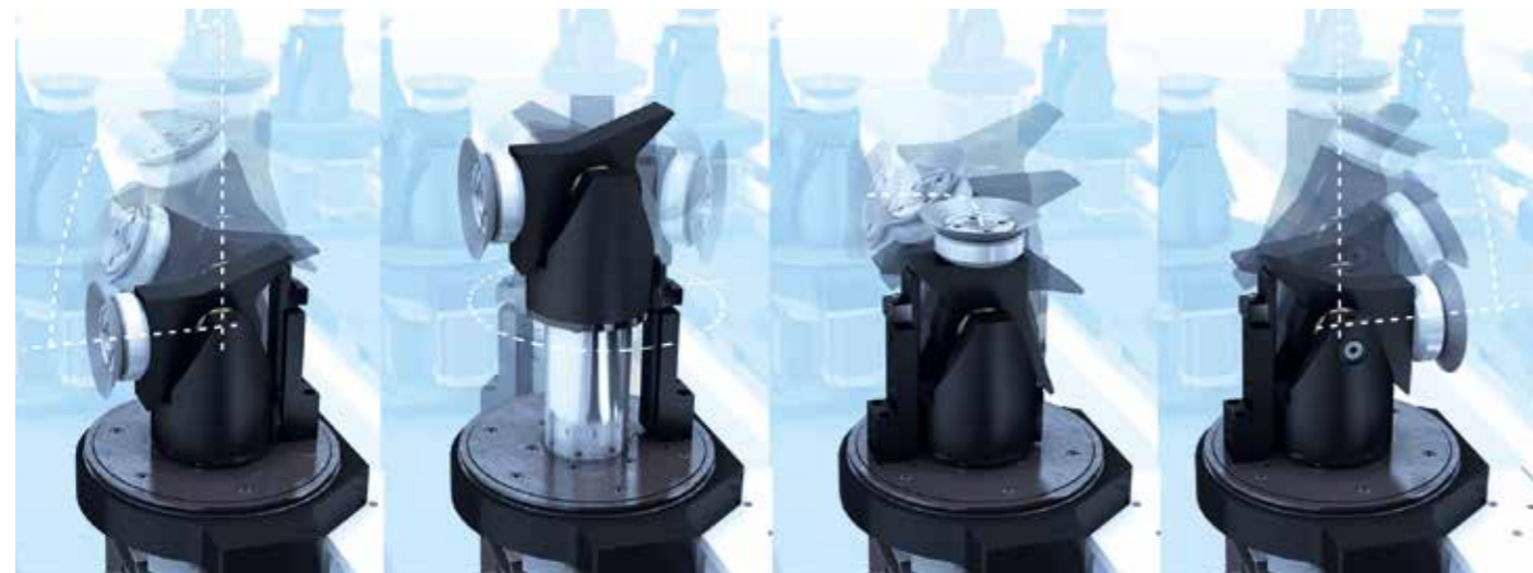
5X ACTUATOR WITH CN-CONTROLLED ORIENTATION IN THE SPACE (0-90° / 360°)