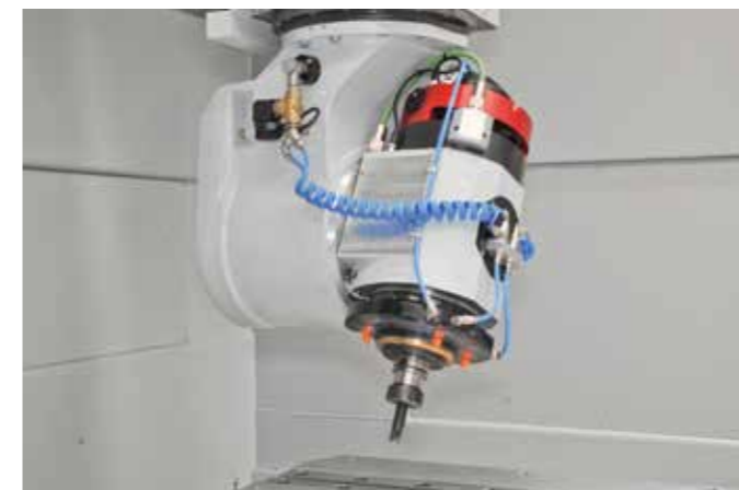
5 axes milling unit with direct drive technology