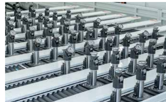
3/5-AXES UHF TABLE The system allows the location of the actuators and cups very precisely in areas that specifically require supporting during the machining operation.