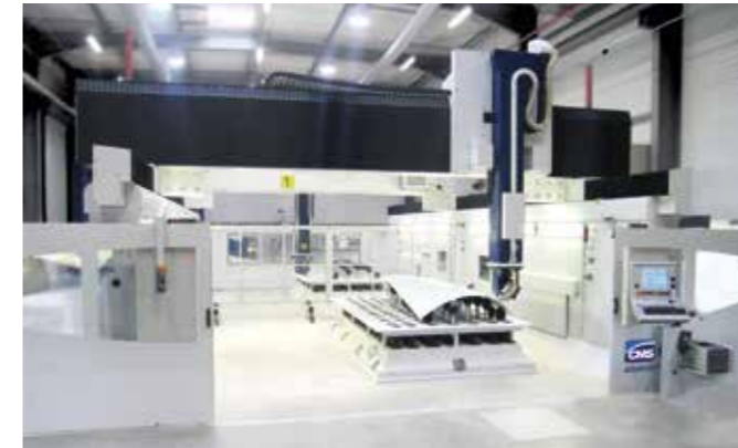
UHF MATRIX TABLE Grid configuration structure with plug-and-play actuators.

CMS Universal Holding Fixtures (UHF) are available in different design configurations, horizontal, vertical, tilting, single axis, multi axis (including a patented 5-axis solution) and in any required size to be integrated with other Ethos machines.