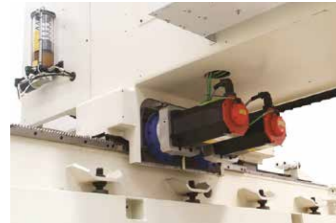
Kinematics with two drive motors on linear axes: backlash recovery, higher rigidity