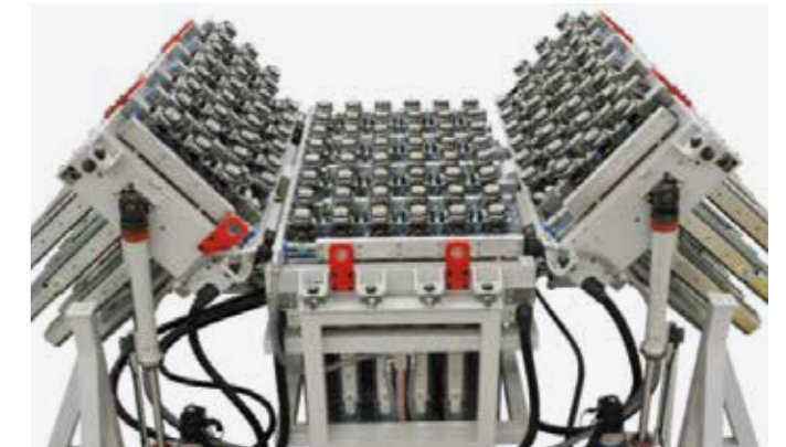
TILTING UHF TABLE The central portion of the table is fixed while the two lateral areas can be inclined up to 45°; the inclination is motorized and NC controlled. A very efficient solution for curved parts which have tight radius.