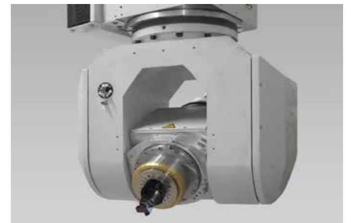
FX5 fork type double torque operating unit