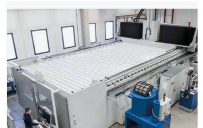
Bellows-type roof for dust and aluminium chips control