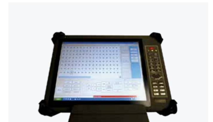
UHF CONTROL TABLET UHF programming and anti-collision control software, directly integrated with the CAD/CAM system.