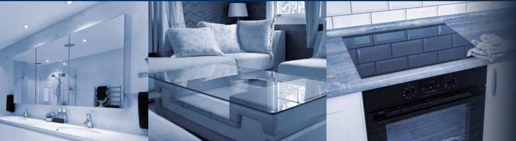
mirrors | tables | ovens and hobs

T echnological. O riginal. P erforming solutions.