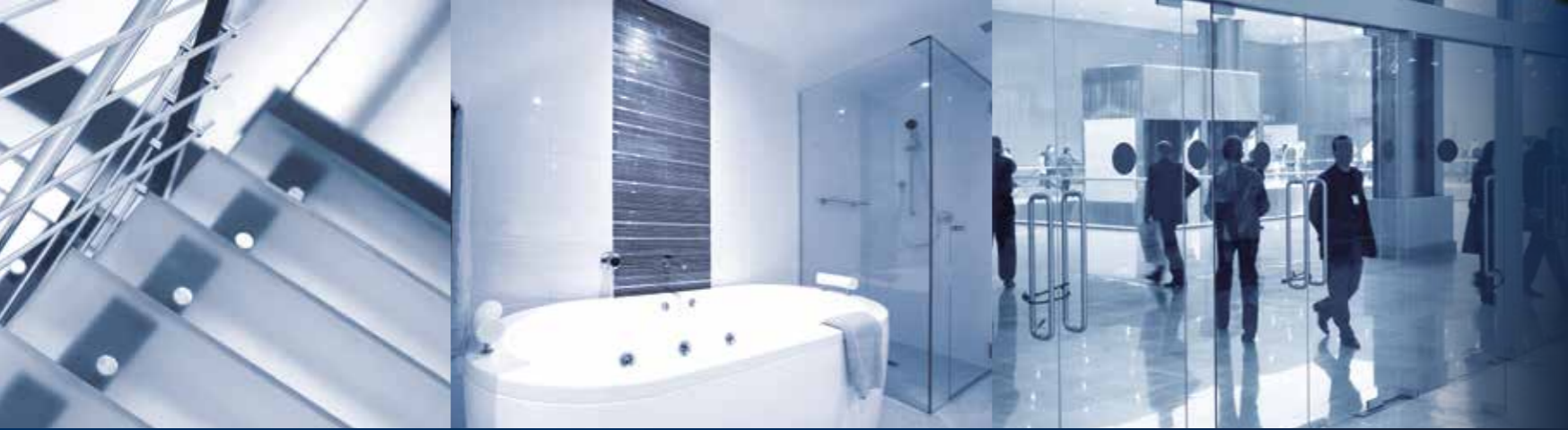
doors | stairs | bathroom tops