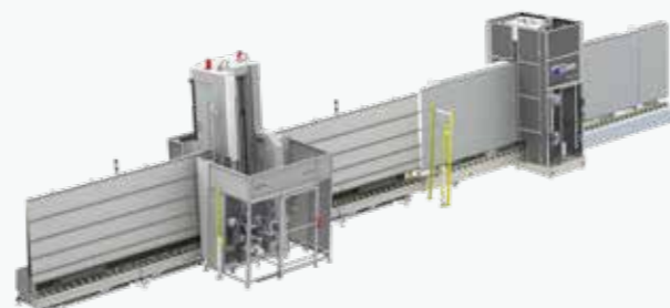
YPSOS + VERTEC MILL