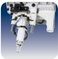
Cleaning System very high efficiency