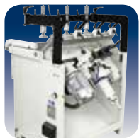
Drilling Head perfect drilling operation