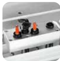
Group for Hinges high-tech devices

Single-head multi-drilling machine with 21 spindles. Ideal solution for woodworking shops and demanding craftsmen.